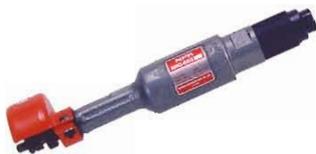
NHG-65G Built-in Governor

The CNS Grinder is most suitable for removing block skin scale, oxide layer, or paint and provides uniform and beautiful facing.