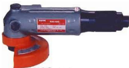
NAG-40G Built-in Governor Low Sound Level