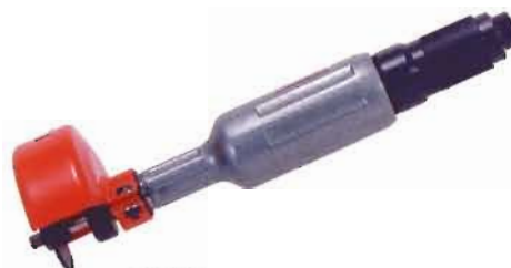
NHG-75G Built-in Governor