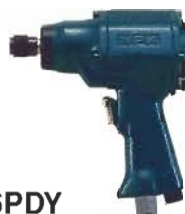
ND-6PDY Built-in Power Regulator 6 steps of power control